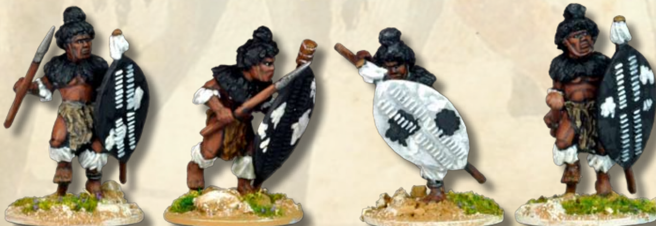
NSA1008 - Matabele Warriors in full Regalia

Were Matabele regiments distinguished from each other by the colour of their shields like the Zulus? Surprisingly, this is not an easy question to answer. Summers and Pagden quote David Carnegie, who was in Matabeleland in the 1880s, as saying that "The different regiments are known by the colours of the shields they carry", and observe that several white veterans of the 1893 war confirm this. "However" they continue, "the Matabele themselves do not seem to agree". According to one informant each regiment "had shields of the same shape", but not necessarily of the same colour. (Illustrations and surviving examples do show minor variations on the standard shape of the war shield, with some photographed in the 1890s being so broad in relation to their length as to be almost circular. There were also much smaller versions carried