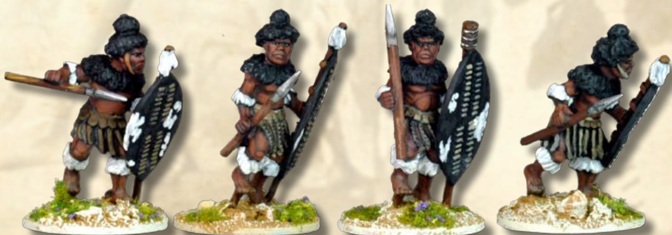
NSA1005 - Matabele Warriors in full Regalia