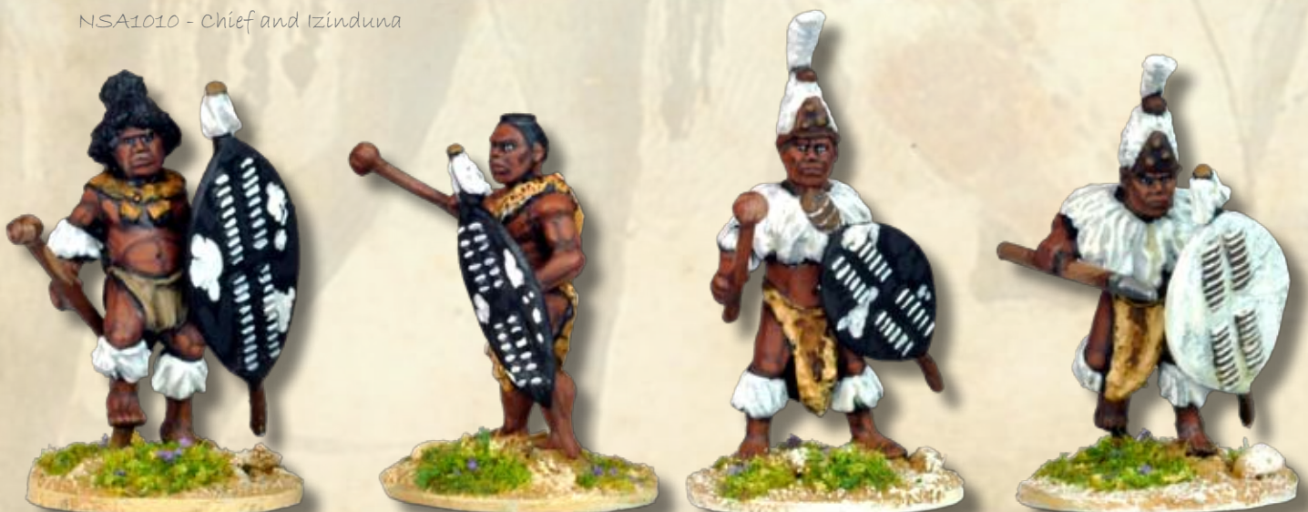
NSA1010 - Chief and Izinduna

Lobengula protested, but held back from giving his "impis" the order to attack. In doing so he missed what may have been his only chance to keep his kingdom. Soon the white colonists were building more forts, establishing farms and mines, and luring young Shona and Matabele men to desert Lobengula and work for them. In 1891 Mashonaland became a British Protectorate, situated at the very point where the borders of Matabeleland were most exposed to attack. Many of the Shona welcomed the whites as protectors against their Matabele masters, and took the opportunity to thumb their noses at them from the imagined security of the new settlements. But the king was not prepared to put up with disrespect from his own "dogs", as he called the Shona. In June 1893 a rebel chief stole some Matabele cattle, an "impi" was sent across the border in pursuit. The warriors had instructions not to molest the whites, but they slaughtered many of their