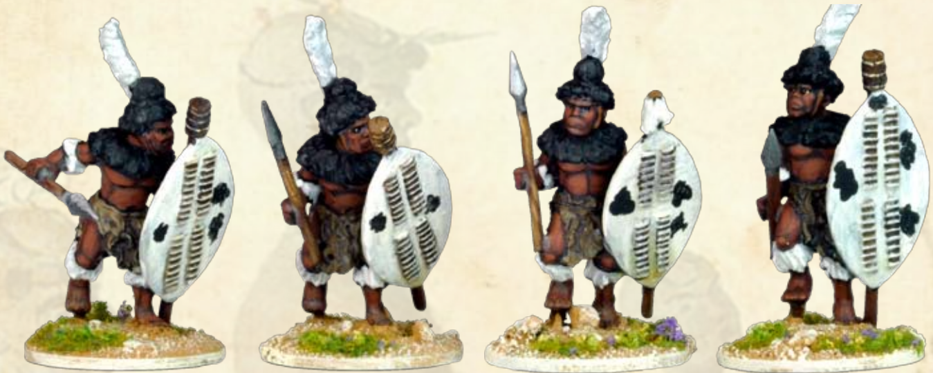
NSA1006 - Matabele Warriors in full Regalia

fragile was still being worn on campaign in Lobengula's day.