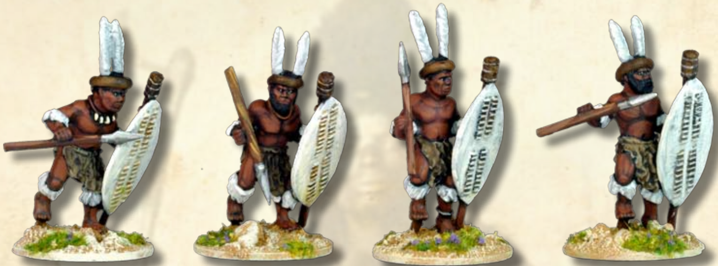
NSA1009 - Matabele Amadoda Warriors

Shona employees, burnt their kraals and took all the cattle they could find. One white settler at Fort Victoria recalled how "insolent Matabele swaggered through the streets of the town with their bloody spears and rattling shields". Just like the Matabele, the subjects of Queen Victoria were not prepared to put up with this sort of insult from what they saw as "lesser breeds". Soon the colonists were advancing into Matabeleland in force from two directions.