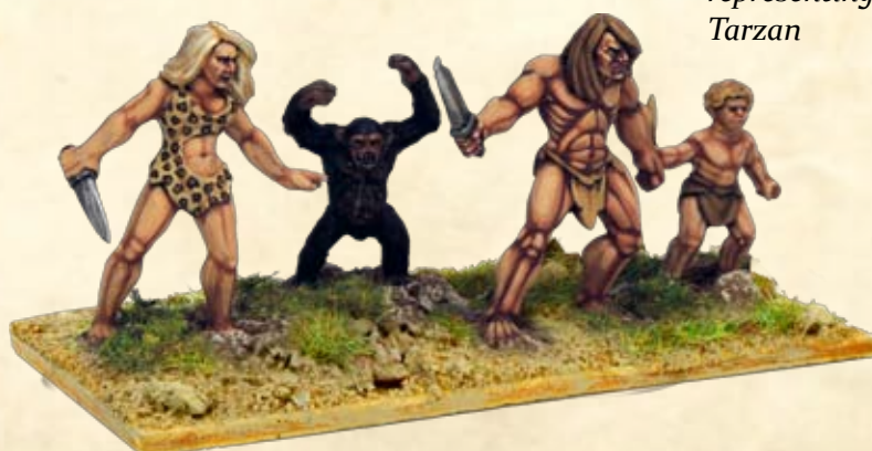
A Chief representing Tarzan

Special Rule: Tarzan is always a single Elite Warriors base and never has to take morale tests, if he is a chief he can also be a single base unlike in normal Tribal armies. The weapons for animals don't actually represent real weapons of course just the effects. They never need field Baggage. It is of course completely fictional and should probably not be allowed in historically based scenarios, or in tournaments without the agreement of all concerned.