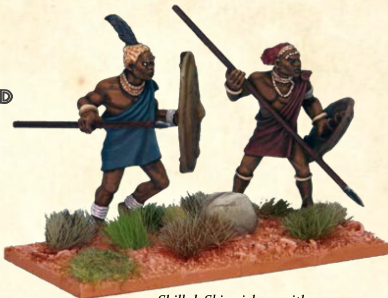
Shilluk Skirmishers with spears.