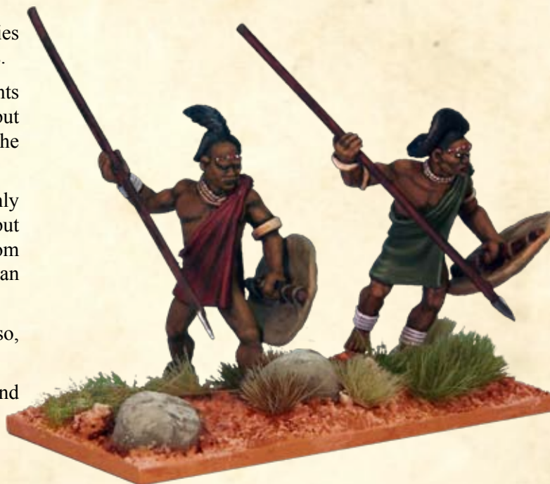
Elite Skirmishers with spears.